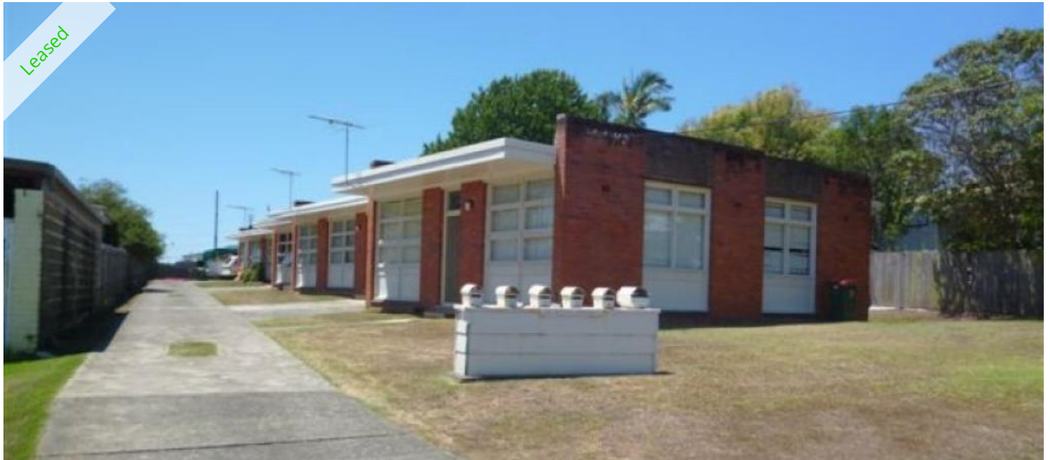
Unit 5, 21 Betts Street, East Kempsey