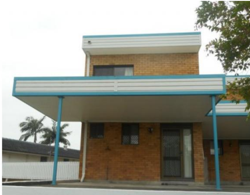
Unit 1, 129 Smith Street, Kempsey