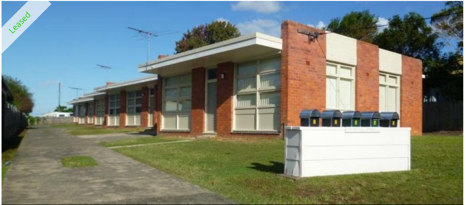
Unit 1, 21 Betts Street, Kempsey