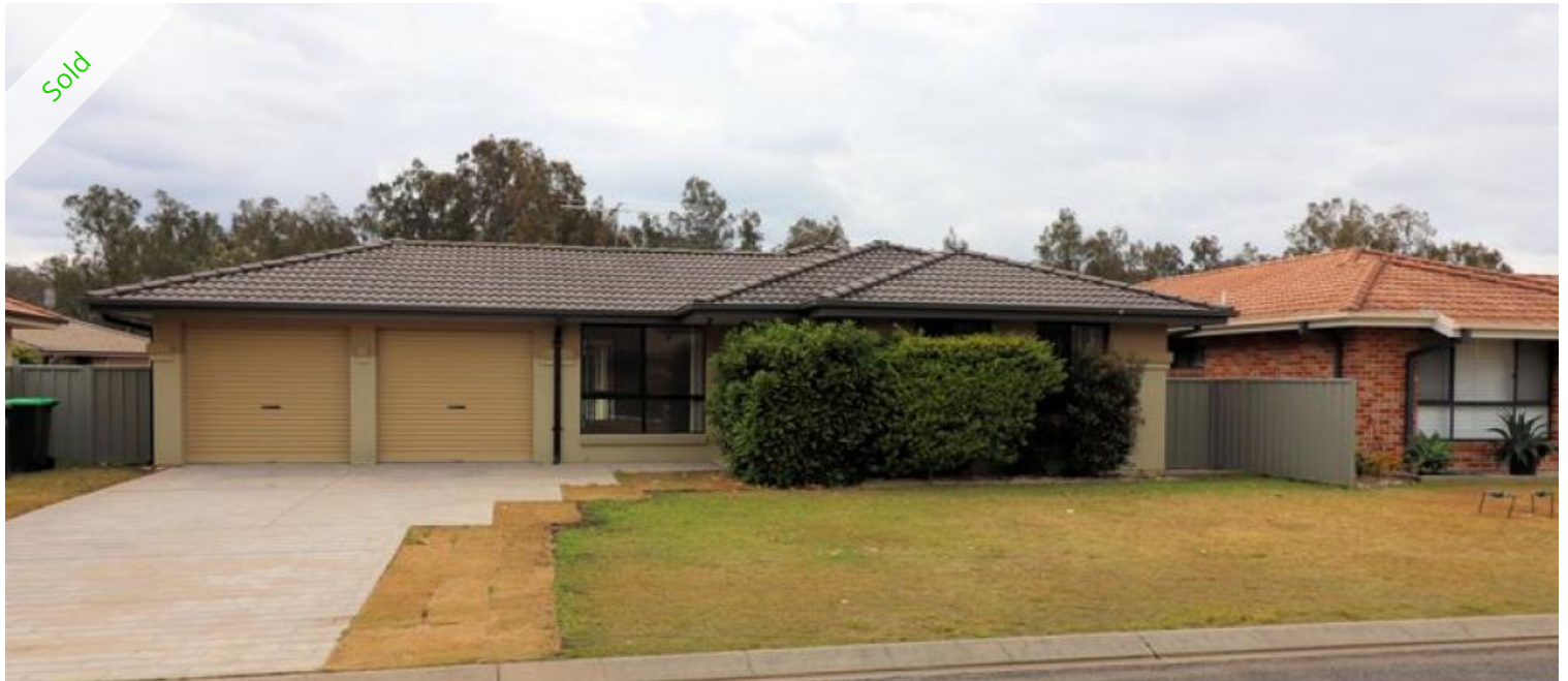
2 Bert Dyson Place, West Kempsey