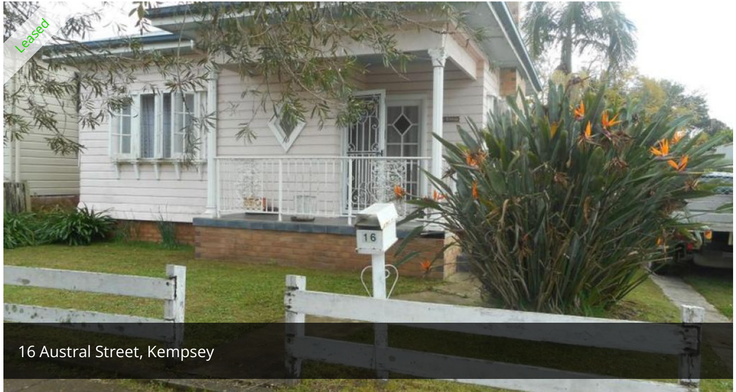
16 Austral Street, Kempsey