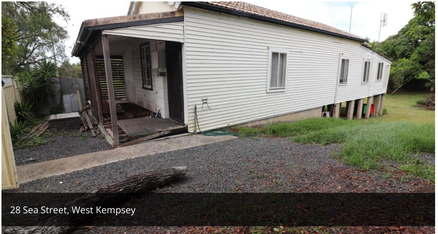
28 Sea Street, West Kempsey