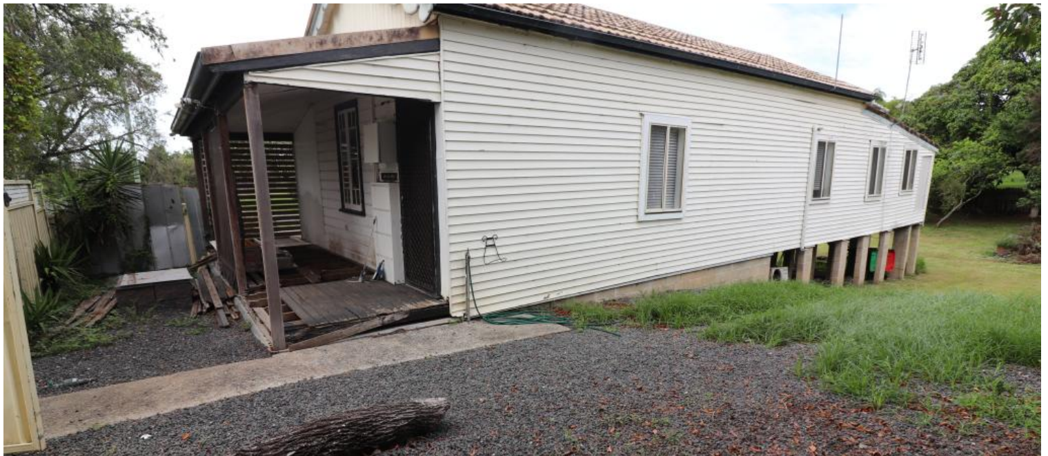
28 Sea Street, West Kempsey