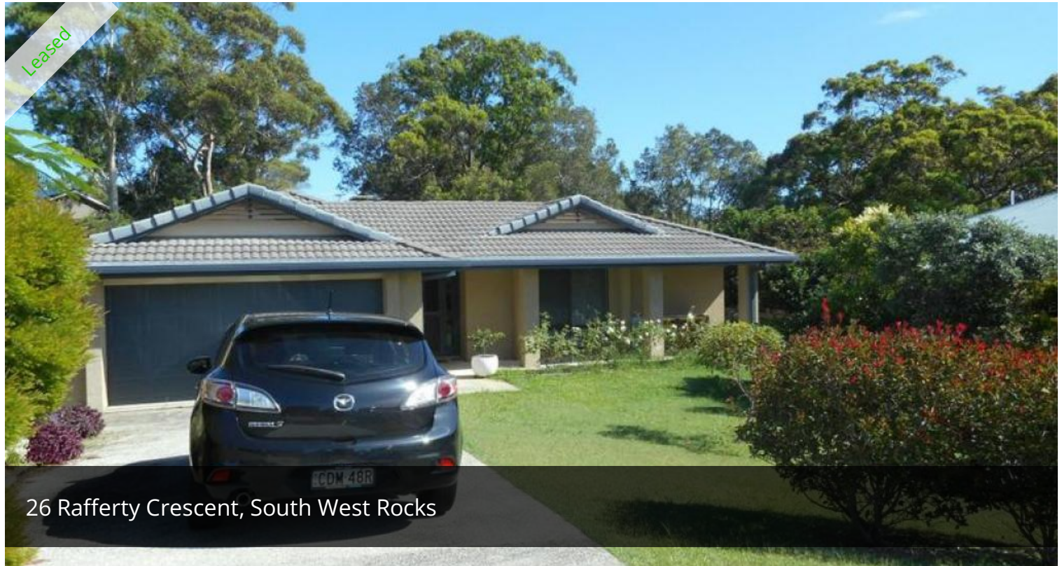
26 Rafferty Crescent, South West Rocks