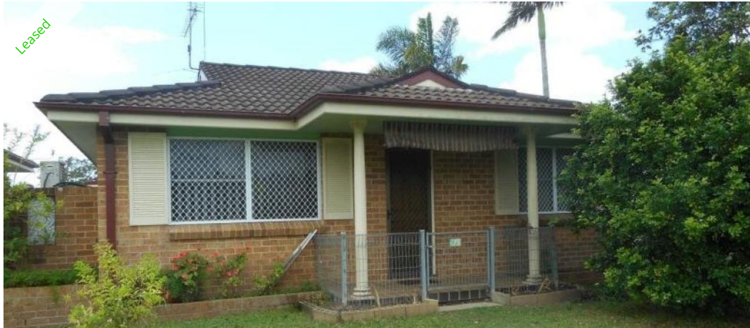
Villa 3, 2 North Street West, Kempsey