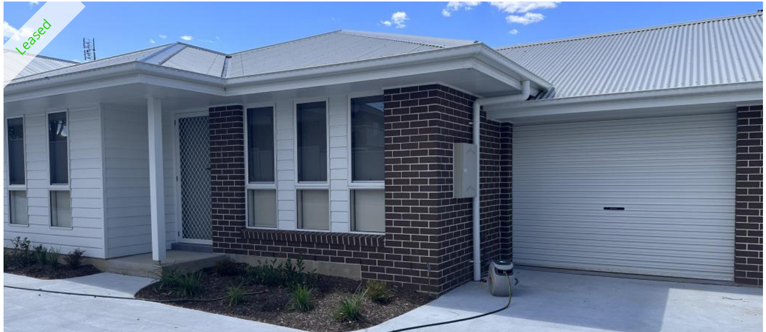
Unit 3, 34 Great North Rd, Frederickton