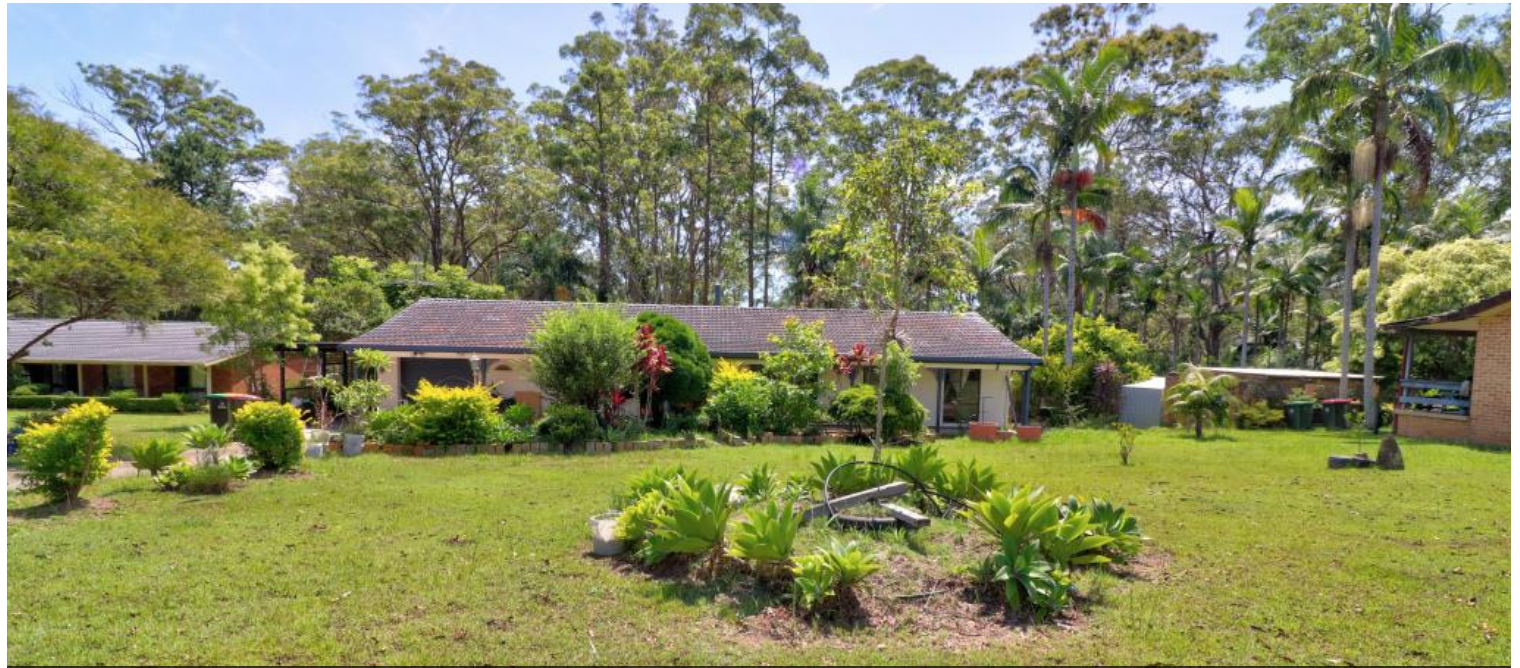
15 Hillview Dr, Yarravel