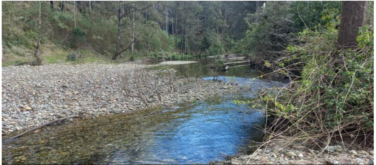
Lot 12, 1762 Five Day Creek Road, Comara