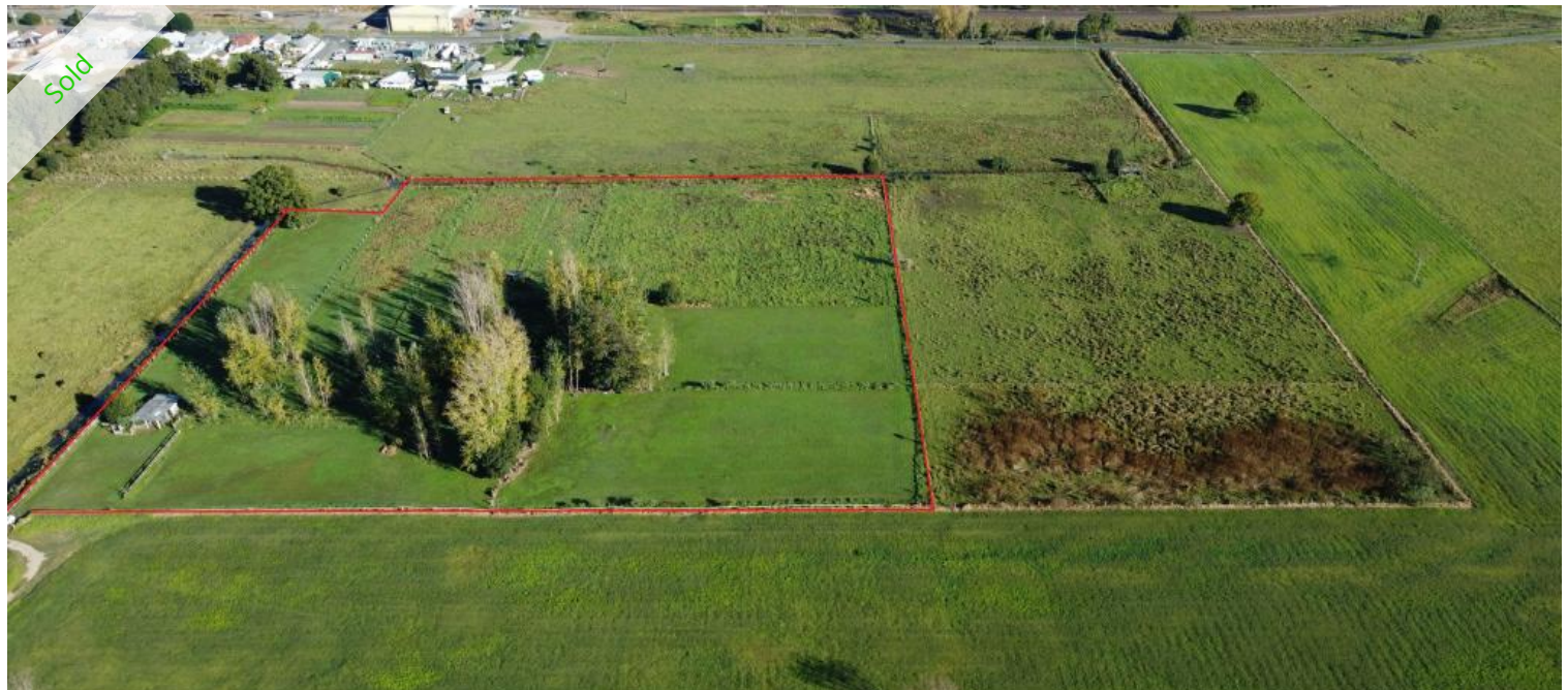
Lot/ 1 & 32 Regent Street, Kempsey