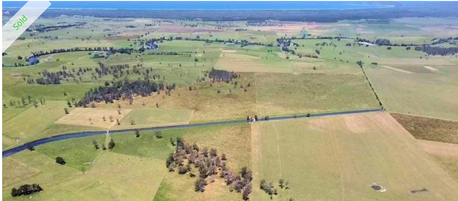
Lots A & B, Kinchela