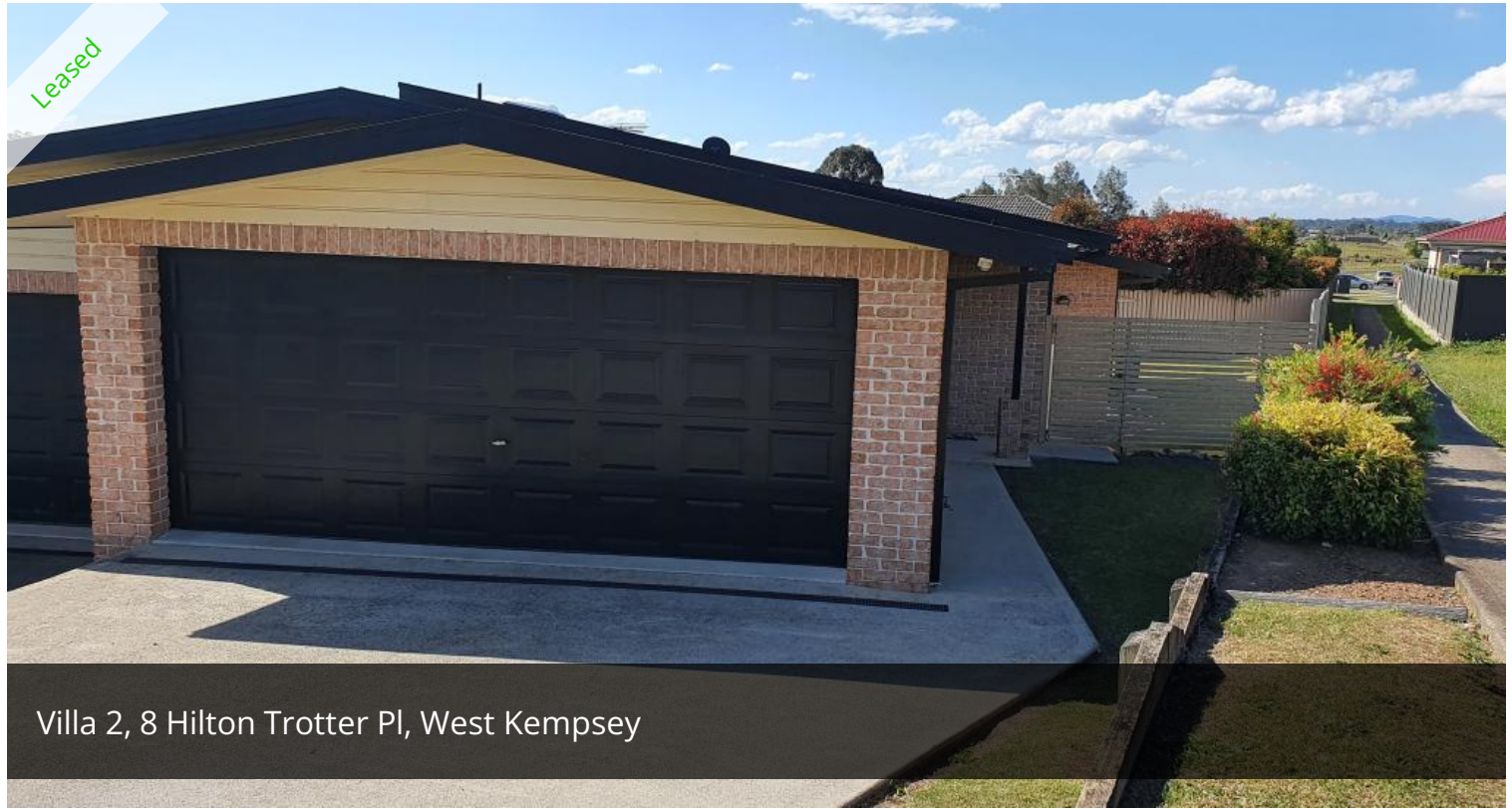
Villa 2, 8 Hilton Trotter Pl, West Kempsey