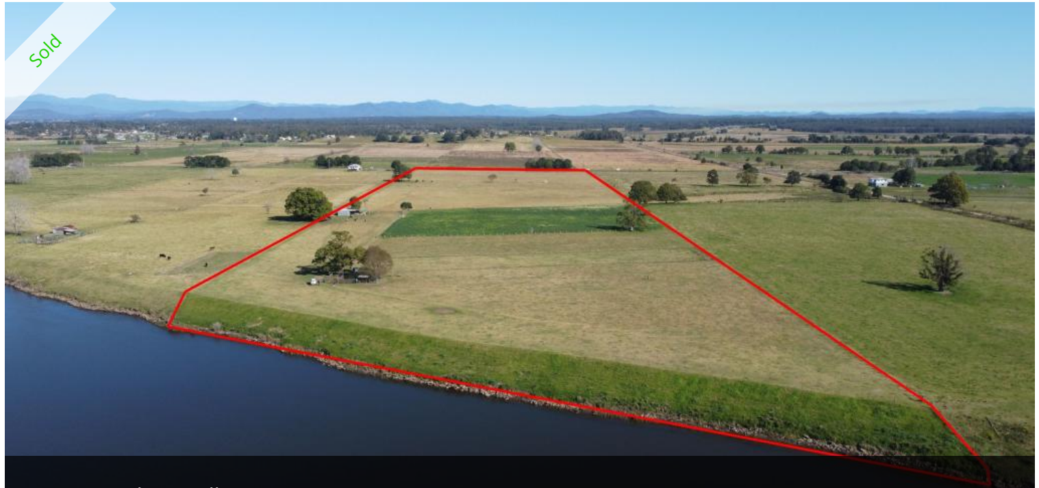
Lot 35 Macleay Valley Way, Kempsey