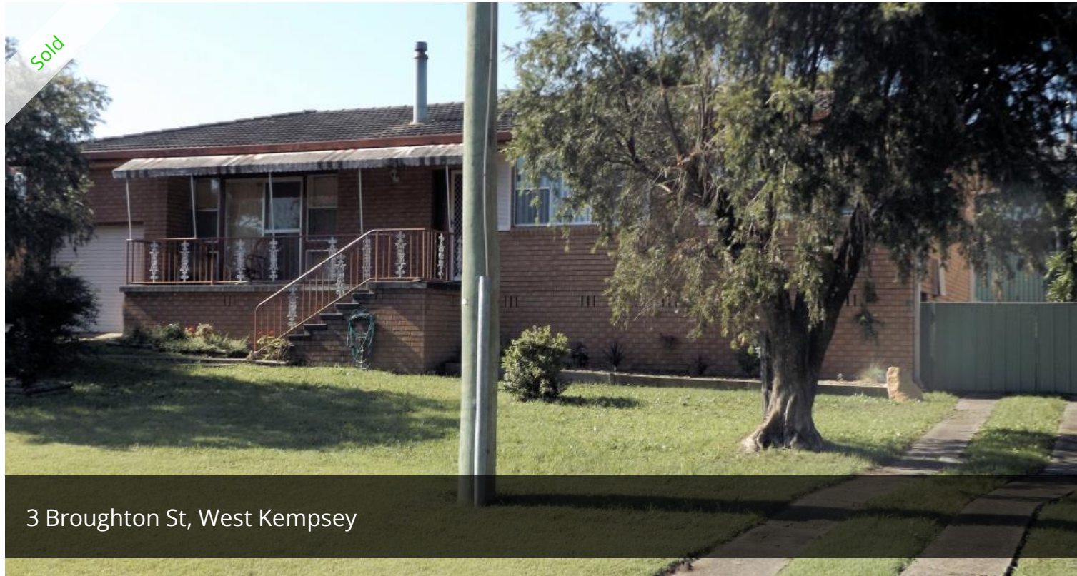
3 Broughton St, West Kempsey