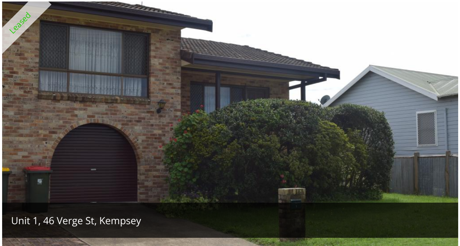
Unit 1, 46 Verge St, Kempsey