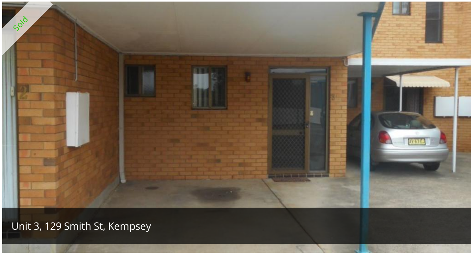
Unit 3, 129 Smith St, Kempsey