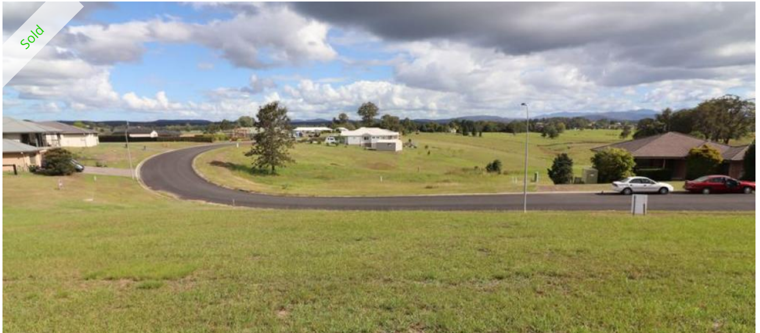
Lot , 14 Springfields Drive, Greenhill