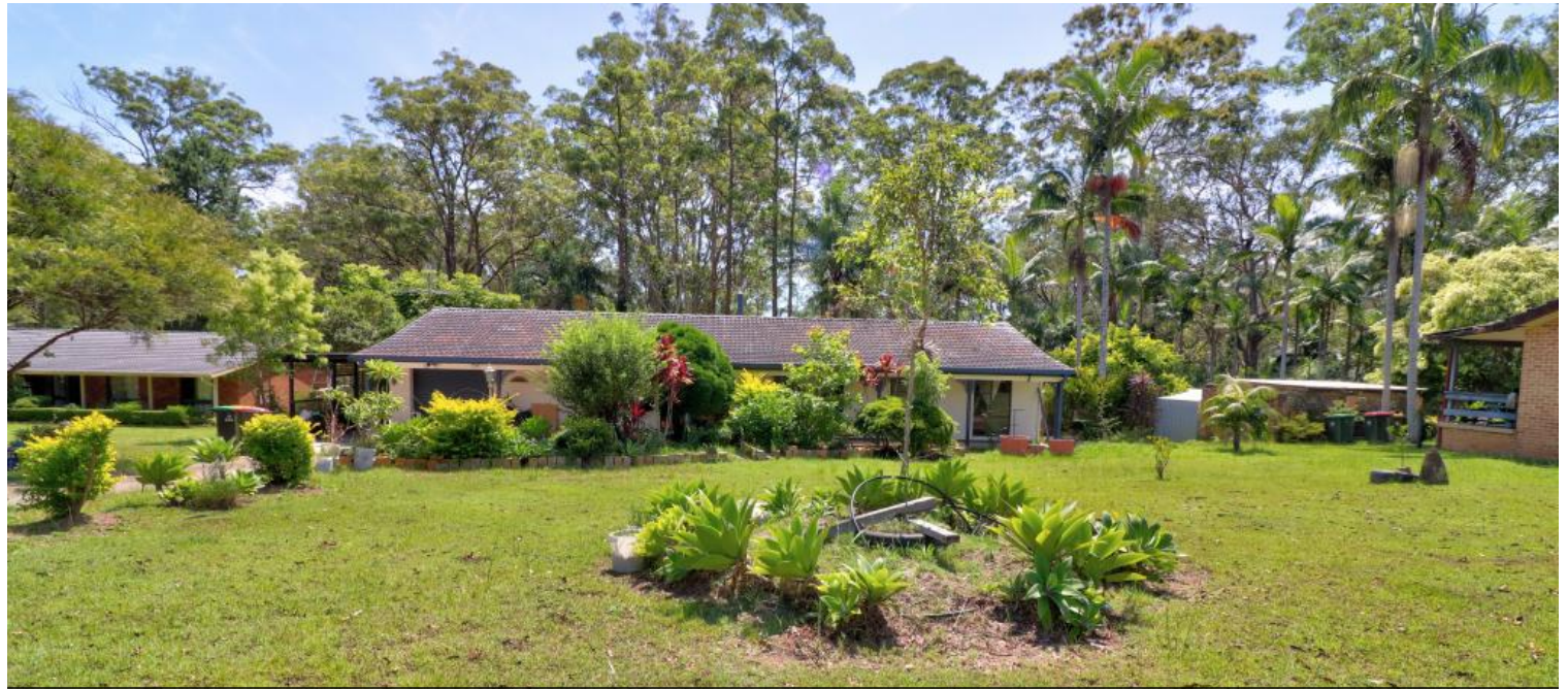
15 Hillview Dr, Yarravel