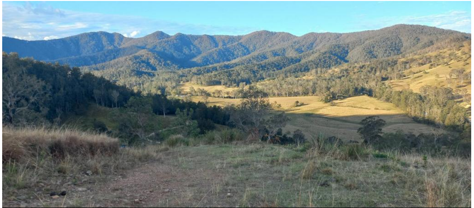
Lot 21, Five Day Creek, Comara